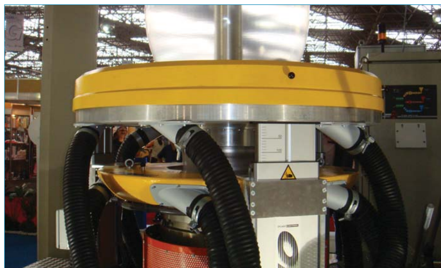
Double Air Ring detail.

The direct motor-reducer with flexible coupling, with the elimination of other transmissions, reduces the energy consumption by up to 10%.