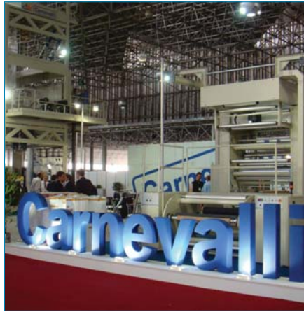
General view from Carnevalli's booth at the 6th Brasilpack.

Following an international trend in bringing together in a single event all packaging and graphic industries, the 1st International Week of Packaging, Impression and Logistics has been a success. Integrated by the 6th Brasilpack (International Packaging Trade Fair); 19th FIEPAG (International Trade Fair of Papers and Graphic Industry); 2nd Flexo Latin America (International Flexographic Trade Fair); 5th Innovation