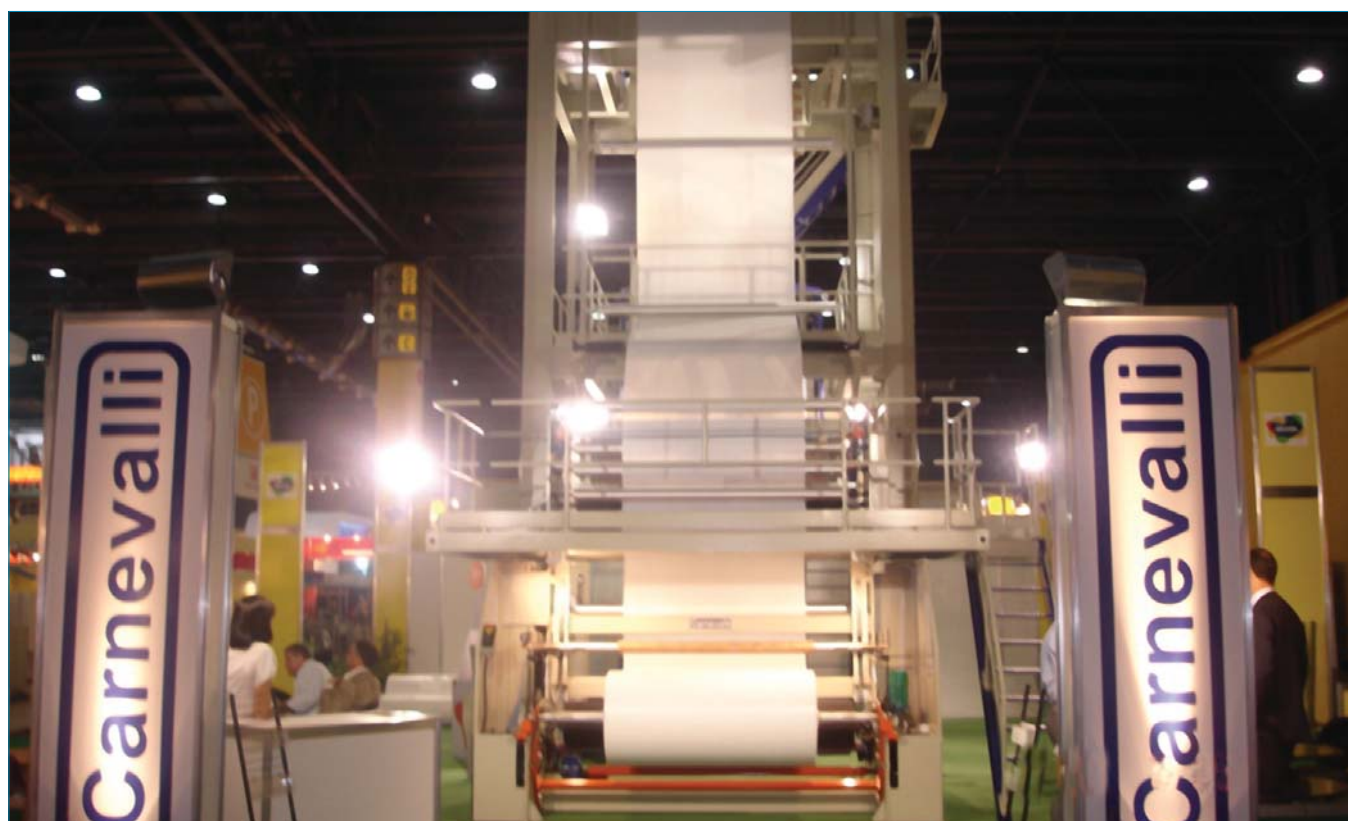
Single Layer Extruder Polaris Magnum 75